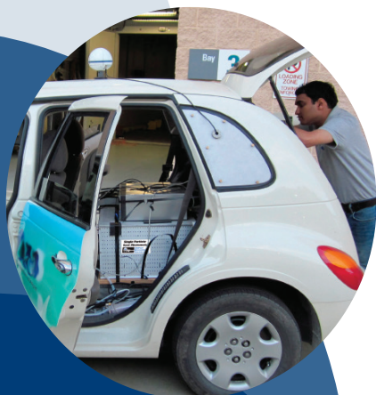
Mobile Sampling Unit with SP2